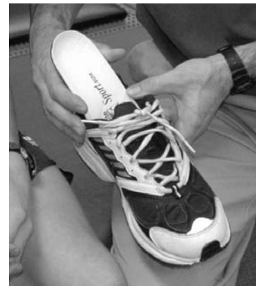
Orthotics may help to normalize running mechanics

Most importantly, our staff can guide runners through re-introduction and progression of their training to make sure problems don't recur. In addition to our rehabilitation efforts with the runner, close communication with coaches and parents about return to full function can make the difference between success and failure, particularly in the midst of a competitive season.