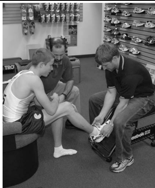
Extraordinary efforts to get the "right" shoe

Belden Village 330-649-9870 • Massillon 330-832-9999