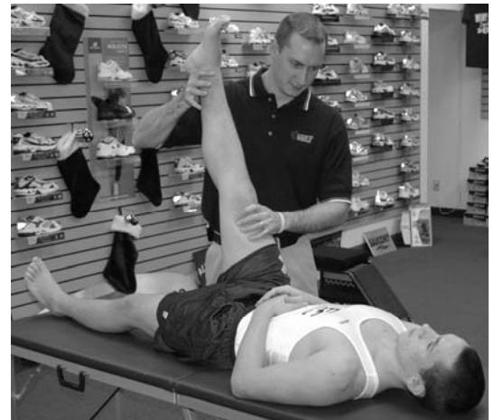
Evaluation of leg strength & flexibility