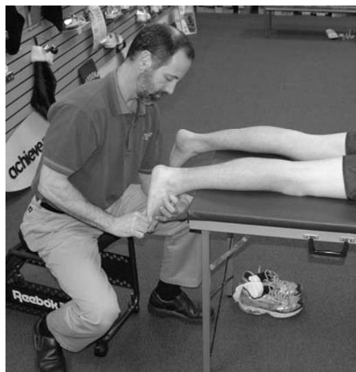
Biomechanical assessment is critical

For the past 15 years, we've been screening the national class runners of Malone College and the elite high school cross-country runners of East Canton High School. The result for these teams has been very favorable -- reduction or elimination of lost-time injuries and a mechanism for quick identification and management of aches and pains.